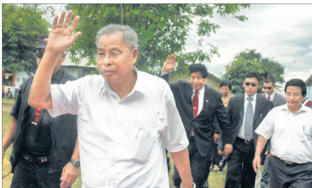
Isak and Muivah at the 6th Naga People's Consultative Meeting near Dimapur in 2007.

The NSCN (IM) leadership has a dominance of Tangkhuls — a Naga tribe inhabiting Senapati, Ukhrul, Chandel and Tameng-